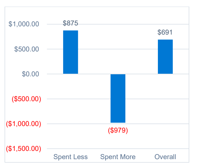
TABLE 2: AVERAGE ANNUAL AMOUNT BY BENEFICIARY COHORT