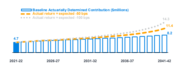
FIGURE 1: IMPACT OF INVESTMENT RETURNS

As you can see, over time the Actuarially Determined Contribution can be significantly higher if the actual investment return is always 100 basis points lower than the assumption. This can create considerable issues for a plan, as well as future generations of plan members and taxpayers.