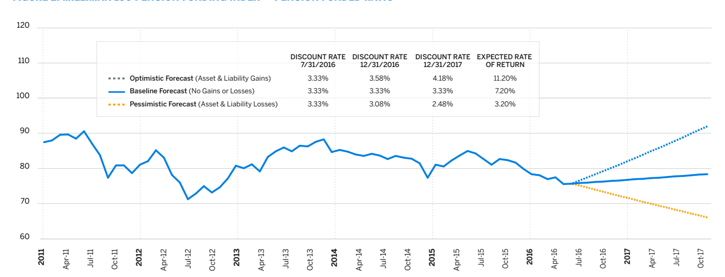
FIGURE 2: MILLIMAN 100 PENSION FUNDING INDEX — PENSION FUNDED RATIO

Over the last 12 months (August 2015 – July 2016), the cumulative asset return for these pensions has been 4.10% and the Milliman 100 PFI funded status deficit has deteriorated by $186 billion. The rise in the funded status deficit over the past 12 months is primarily due to decreases in discount rates. The funded ratio of the Milliman 100 companies has decreased over the past 12 months to 75.7% from 84.3%.