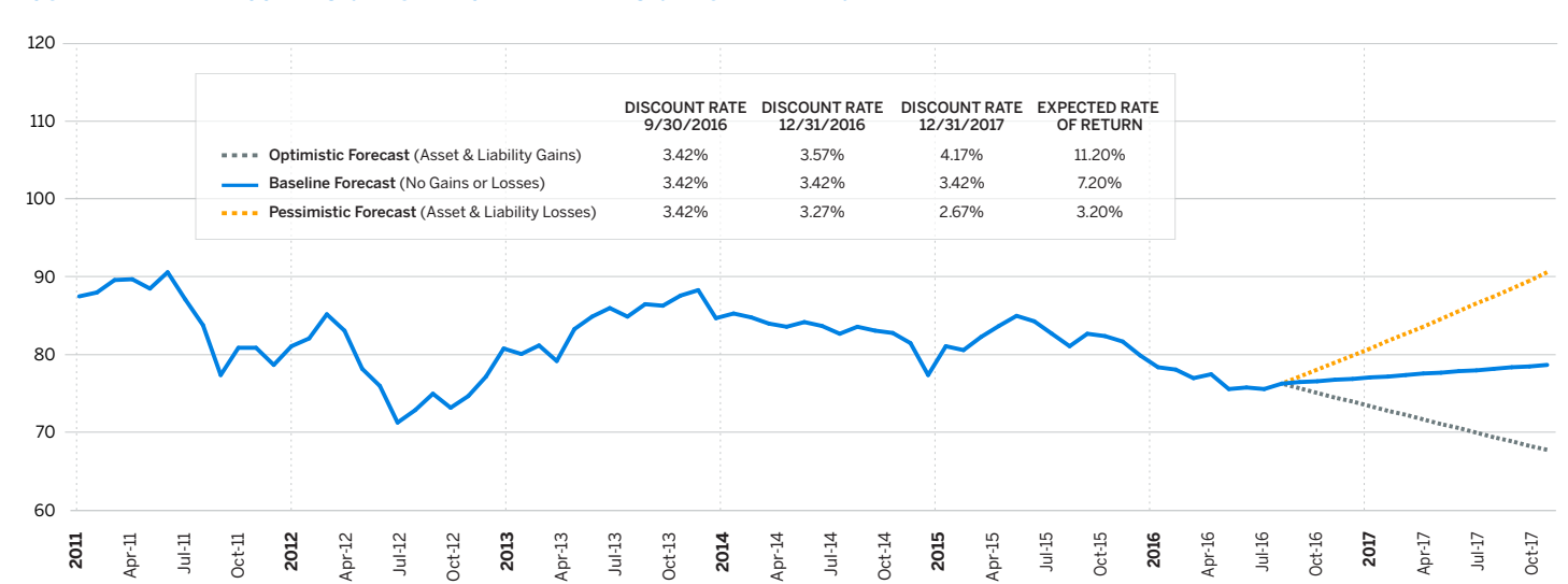
FIGURE 2: MILLIMAN 100 PENSION FUNDING INDEX — PENSION FUNDED RATIO

Over the last 12 months (October 2015 – September 2016), the cumulative asset return for these pensions has been 8.47%; however, the Milliman 100 PFI funded status deficit has deteriorated by $117 billion. The rise in the funded status deficit over the past 12 months is primarily due to decreases in discount rates, on the order of 77 basis points. The funded ratio of the Milliman 100 companies has decreased over the past 12 months to 76.3% from 81.1%. Getting back to the 80% funded level before the end of the year requires a 3.7% improvement and remains a significant hurdle for the Milliman 100 plans in aggregate as the funded status deficit has risen by $130 billion so far in 2016.