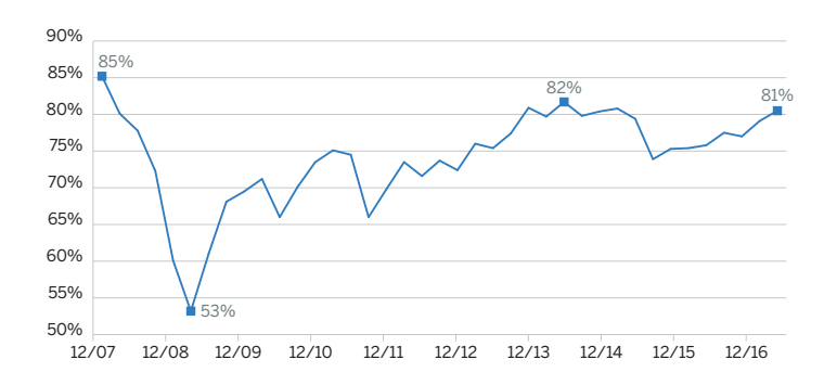
FIGURE 2: AGGREGATE MULTIEMPLOYER PLAN HISTORICAL FUNDED PERCENTAGE – MARKET VALUE BASIS

Figure 2 provides a historical perspective on the aggregate funded percentage of all multiemployer plans since the end of 2007 on a market value basis. In aggregate, multiemployer plan funding as of June 30, 2017, is nearing its best position since the market collapse of 2008, once again edging up to more than 80%. This recent improvement is driven largely by favorable investment returns. Our simplified portfolio earned about 7.6% in the first six months of 2017, on the heels of a 7.7% return during the 12 months of calendar year 2016. As discussed in previous studies, the funded status of these plans continues to be almost entirely driven by investment performance.