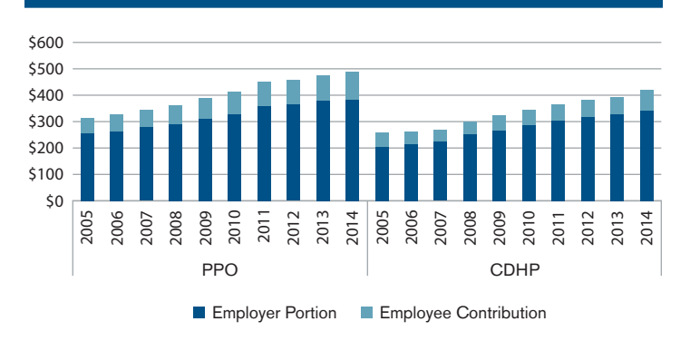
FIGURE 4: MEDICAL PLAN PREMIUMS AND CONTRIBUTIONS

What the future holds for employer-sponsored medical plans will largely be driven by medical inflation as well as further healthcare reform, likely determined by the upcoming presidential election and decisions made by Congress. We expect that employers will keep reducing the value of medical benefits offered, continuing to shift toward CDHP plans over the next few years. The percentage of total premium that employees will pay for self only coverage in contributions will likely hold steady in order to limit exposure to the ACA's affordability threshold. Rather than simply making reactionary changes through cost-sharing and cost-shifting, though, employers will need to be more proactive about the health of their employees. Internally, this could mean creating wellness incentives and penalties for unwanted behaviors, educating employees to be more prudent consumers of healthcare. Externally, employers will need to be more aggressive with their carriers, if they want to affect long-term changes, by establishing performance measures that help them move toward improved quality and pricing.