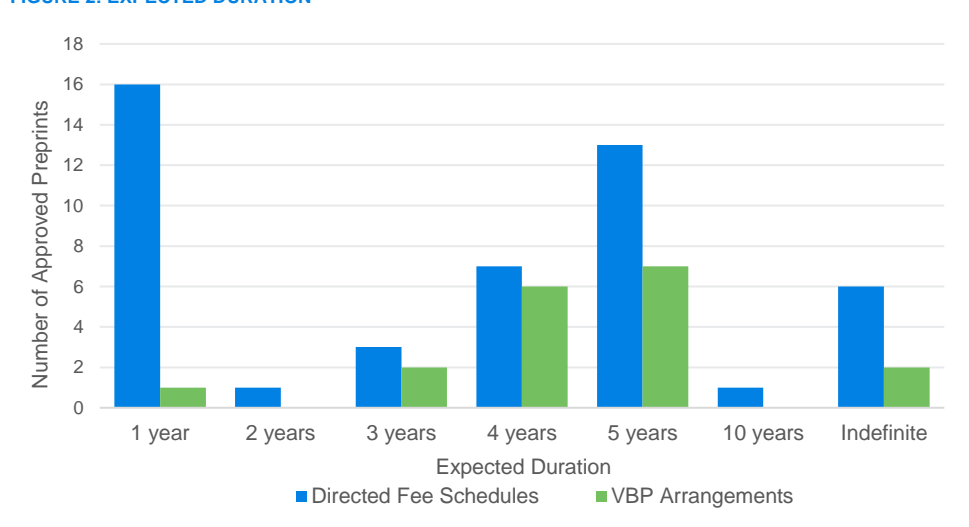
FIGURE 2: EXPECTED DURATION

With respect to the two primary categories of state directed payment arrangements, 47 of the approved Preprints (72 percent) were for "State Directed Fee Schedules" and 18 of the approved Preprints (28 percent) were for "State Directed Value-Based Purchasing" arrangements. Figure 3 below shows the distribution of the types of approved Preprints.